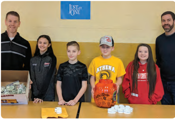
Students at Greece Athena, Odyssey, and Olympia Middle Schools, along with Twelve Corners Middle School in Brighton raised nearly $900 as part of the 2nd Annual Just One Day School Challenge.