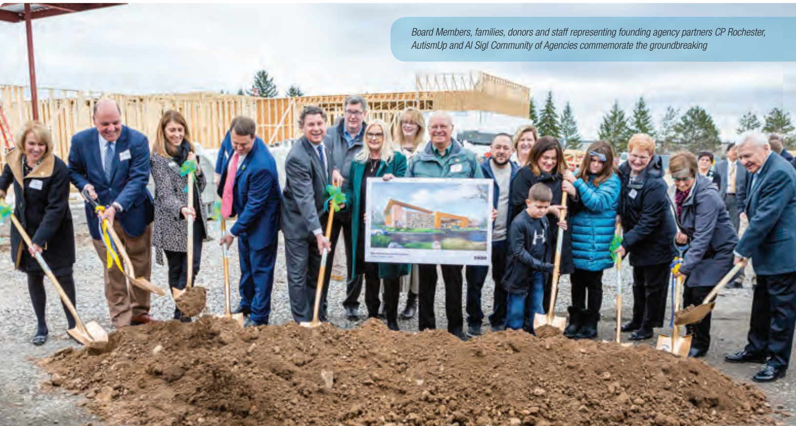
Board Members, families, donors and staff representing founding agency partners CP Rochester, AutismUp and Al Sigl Community of Agencies commemorate the groundbreaking